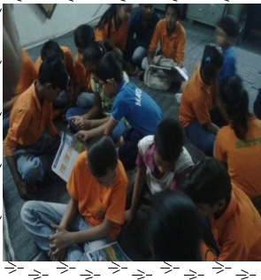
“Visit to Mayoor School For Smart Classes”

On 3 rd May two teachers and 15 students visited Mayoor School for smart class on Environment Studies.