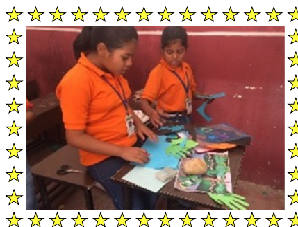
Art & Craft Activity

At our Setu School the three week Summer Camp in May 2016 was a big success, apart from Remedial classes for slow learners, Student involving them in activities like dance, theatre, art and craft, creation of artefacts for fund raising along with environment initiatives . The summer Camp culminated with Training programs for teachers.