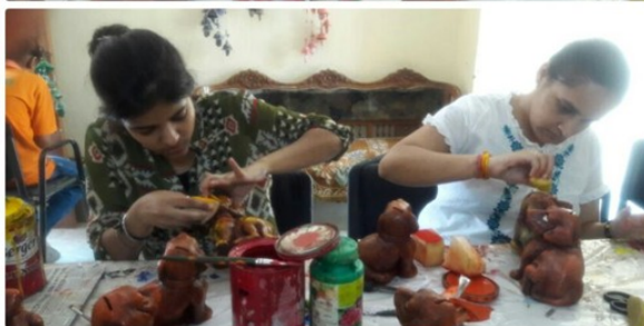
“Artifacts created by students & teachers”