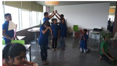
“Students of PWC performed one skit on save environment”