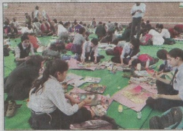
नोएडा के सेक्टर-126 स्थित मयूर स्कूल में सेतु फाउंडेशन के तत्वावधान में आयोजित पेंटिंग प्रतियोगिता में भाग लेते बच्चे।

नोएडा, (पंजाब केसरी): शुक्रवार को सेक्टर-126 स्थित मयूर स्कूल में सेतु फाउंडेशन के द्वारा पेंटिंग प्रतियोगिता का आयोजन किया गया। जिसमें शहर के विभिन्न स्कूलों के छात्रों ने हिस्सा लिया। पेंटिंग प्रतियोगिता में ज्यादातर स्कूली बच्चों ने पर्यावरण बचाने का संदेश दिया। जिससे साफ पता चल रहा है कि दिल्ली एनसीआर के प्रदूषण का एक गम्भीर मुद्दा है। प्रतियोगिता में विजयी बच्चों का पुरस्कार देकर सम्मानित किया गया। सेक्टर-31 स्थित निटारी में सेतु फाउंडेशन की ओर से निःशुल्क शिक्षा उपलब्ध करायी जा रही है।