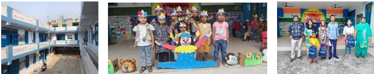
Setu Shiksha Jyoti Kendra, Village Sadarpur, Noida Uttar Pradesh India

The Setu School at Village Sadarpur launched in 21-22 is a World Class facility comparable to any public school. The infrastructure comprises of Classrooms, Science Lab, Library, Computer room, Activity room, a proper lunch Room and a Kitchen. The school is running on Solar power also. Adequate seating space is also available for staff and hygienic wash rooms are also available separately for boys and girls. All the students apart from teaching were provided, Books, Uniform, all Stationery items and Midday meal at the school. In additional the students also underwent regular Health, Eye and Dental Checkups along with immunization Camps.