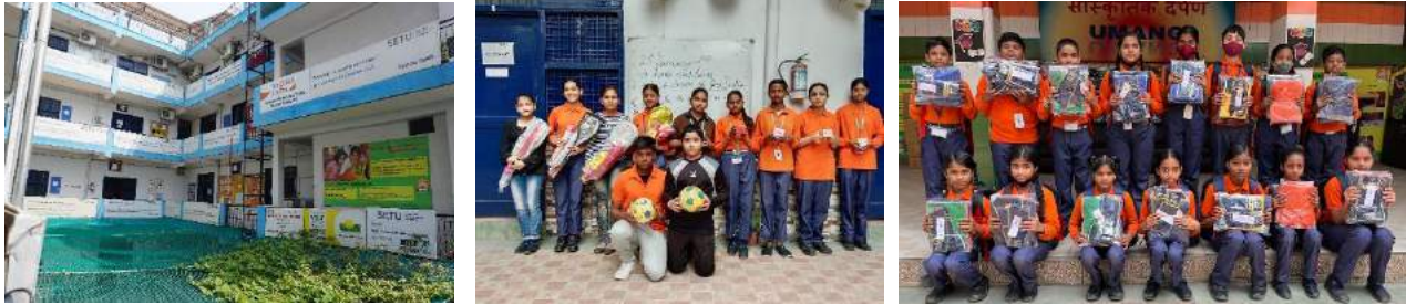
Setu Shiksha Jyoti Kendra, Village Nithari, Noida Uttar Pradesh India

Project Uday – Successfully ensured education of children mainly girls at our school in Village Nithari Sector 31 Noida for 15 years now currently 503 students. Set up 2 nd school in Sadarpur Colony Sector 45 Noida in 2021, currently 451 students and a 3 rd school at Village Changoli Greater Noida in 2022 currently 507 students. Students across class Prep 1 to 12 and 100 students have cleared class 12 exams. Total students 1275.