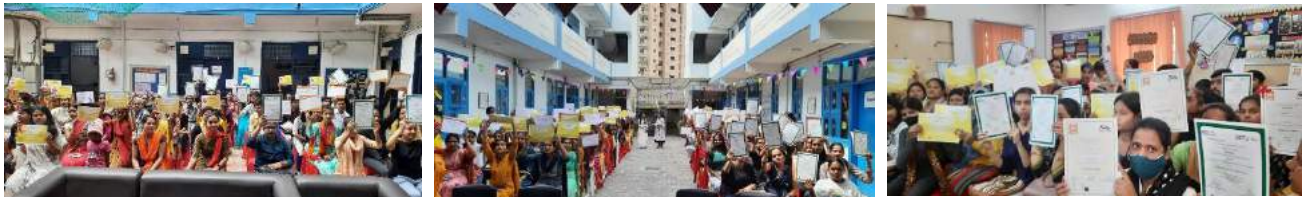
Convocation at Setu Women Empowerment Centres

Project Saksham - Vocational Skill Development courses are currently offered at our Multi Skill Centre at Village Nithari, Village Sadarpur and Sector 12 in Noida Uttar Pradesh as well as at our centres at Dawas and Laliya ka Bas, Jaipur, Rajasthan. Over last one year 1518 people gained skills including 1494 women & 694 placed. "Project Saksham" offer Vocational Skill courses and has a capacity to skill 2240 students in a year.