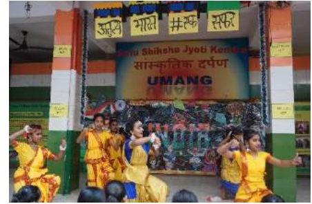
School Annual Day