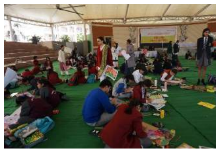
Inter School Painting competition